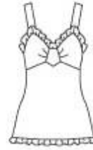
Vogue 2850 view C