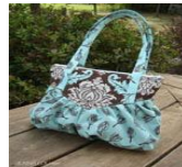
Jenna Lou Bag