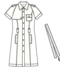
Burda 115 Dress