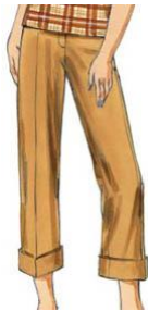
KS 3040 Capris