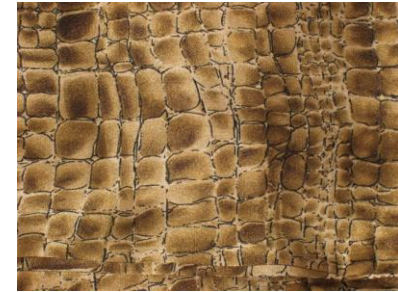
Snakeskin poly charmeuse